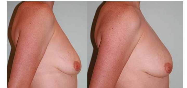
Actual Client Photos after 3rd SkinTyte Treatment – patient will continue to see improvement for 4 months.

SkinTyte® is used to deeply heat dermal collagen. Treatments cause contraction of collagen and force a renewed collagen foundation leading to increased firmness and fullness, as seen in the breasts to the right. The procedure is for patients who desire moderate, noticeable improvements without surgery. There is no down time and treatments are safe for all skin types. It can be performed on any area of the body where an improvement in skin firmness is desired. Popular areas include the face, neck, abdomen, and arms. Full results take up to 4 months following a series of treatments as the collagen foundation of your skin is rebuilt and strengthened.