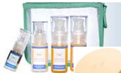
Facial Kits $49.00