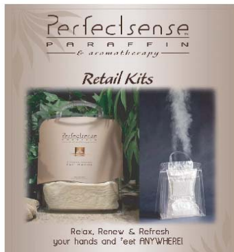
Paraffin Kits $39.99