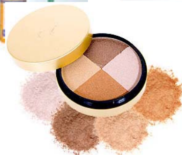
24K Shimmer Powders $12 & Up