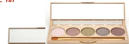
Eye Kits $45