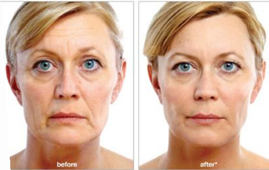
this could be you!