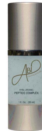
Hyaluronic Peptide Complex

High concentrations of medical grade hyaluronic acid boost hydration and supports skin elasticity. This unique complex contains Argireline . This intense peptide is known to restrict muscle contractions leaving the skin feeling instantly firmer and tighter.