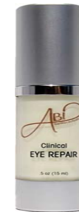
Clinical Eye Repair Cream

A new cutting edge skin care product with ingredients such as Eyeliss® to reduces under eye bags & Haloxyl® to reduce dark circles while firming & toning sagging skin. Eye Repair contains antioxidants & peptides for maximum anti aging benefits.